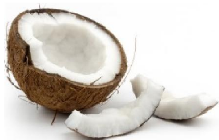
NOCE DI COCCO